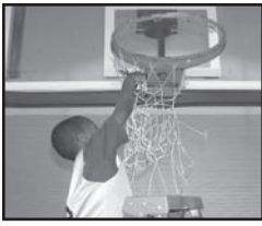
Cutting down the nets!