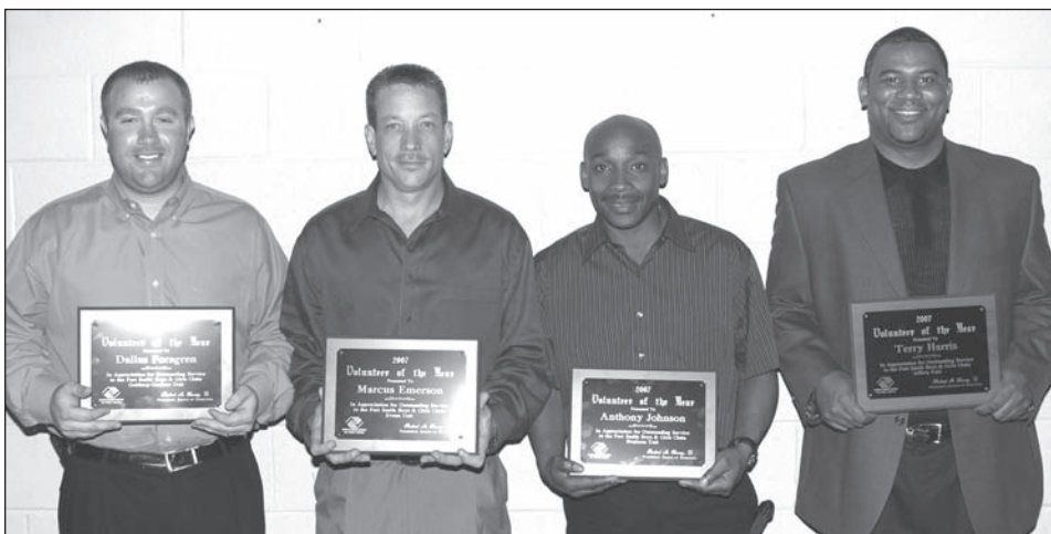
2007 Volunteer of the Year Recipients