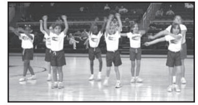
Drill team performs at UAFS