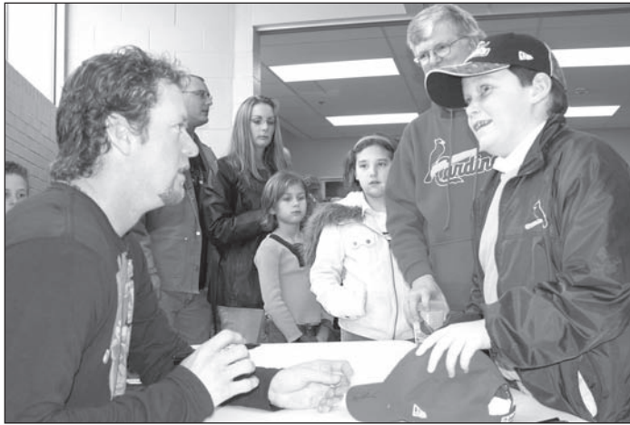
Ryan Franklin talks to baseball fans during his special visit to the Fort Smith Boys & Girls Club (Evans Unit) on Feb. 3.